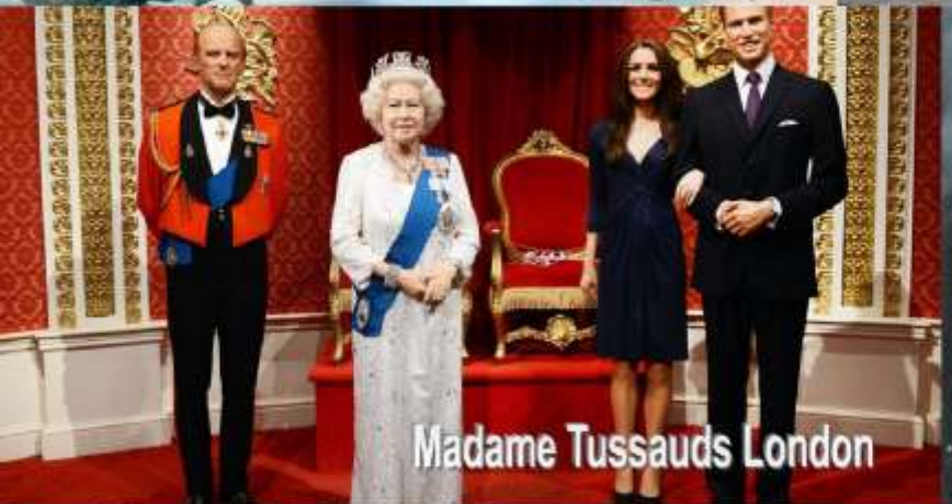
Madame Tussauds London