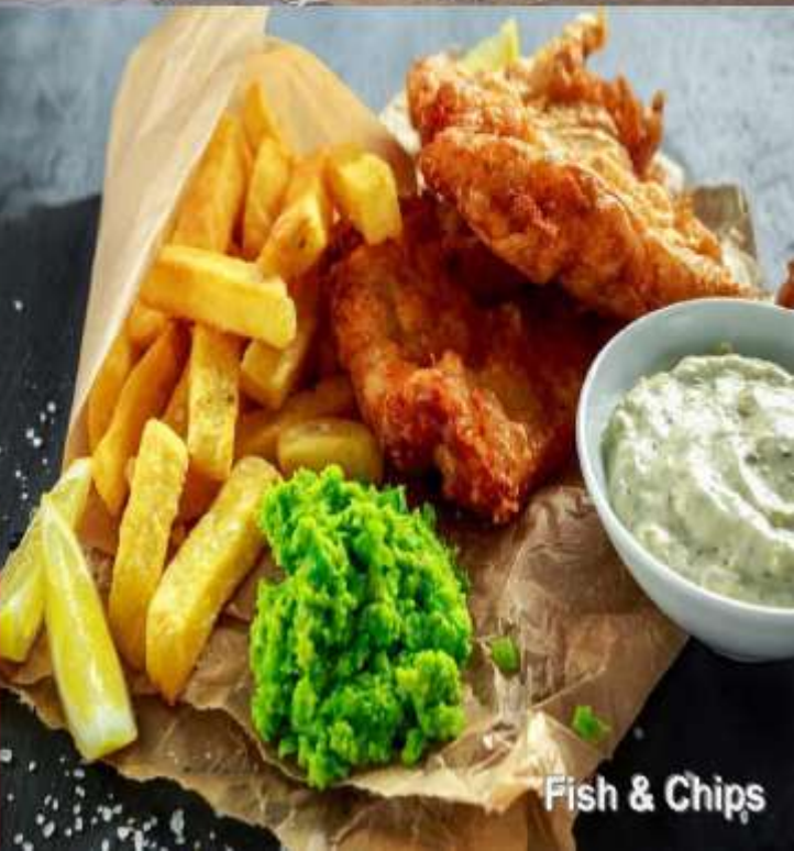
Fish & Chips