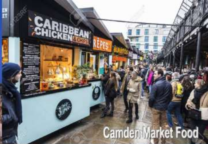
Camden Market Food